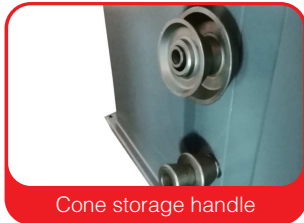
Cone storage handle